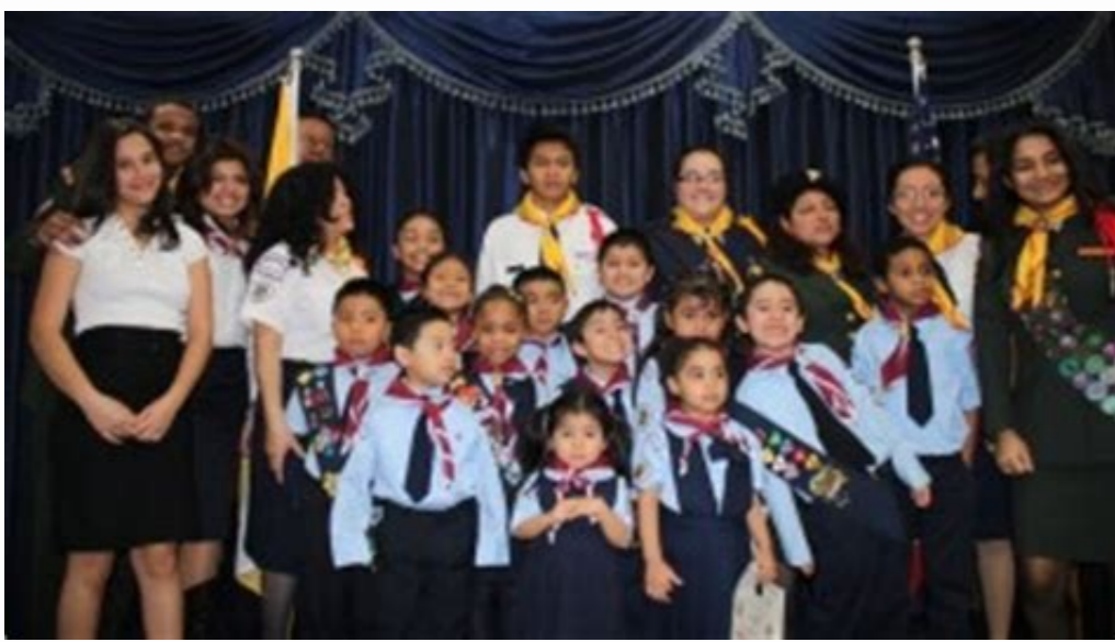
Seventh day adventist master guide curriculum.